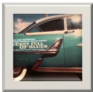
Bucket full of Blues 3 Canadian Music Awards